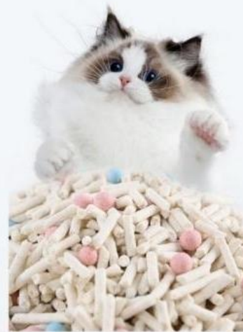
Pet feeds, Cat litter